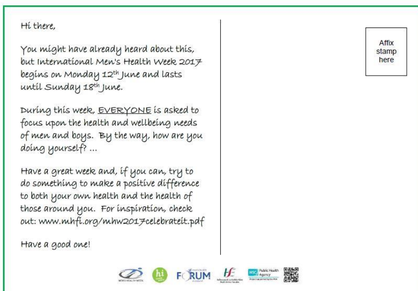
Text side of MHW 2017 Postcard